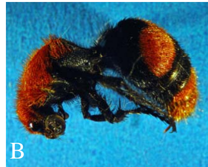
Velvet ants: A, male; B, female.