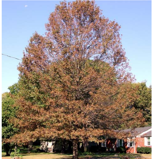
Mature pin oak infected with bacterial leaf scorch. Symptoms may appear in mid-summer to early fall.

Pin oak, red oak, shingle oak, sycamore, red maple, mulberry and hackberry are common hosts. There are also numerous weed hosts of X. fastidiosa which may act as reservoirs of the bacterium.