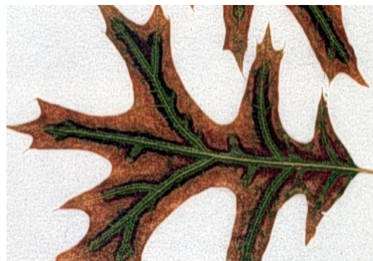
Marginal scorch of a pin oak leaf infected with bacterial leaf scorch.

Bacterial Leaf Scorch