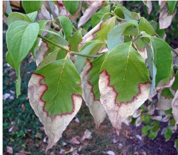
Moderate leaf scorch due to drought stress on a semi-mature flowering dogwood in a Nashville landscape.

This drought also makes some woody plants more susceptible to canker diseases. Fungal canker diseases are caused by pathogens such as Botryosphaeria , Phomopsis and Seiridium . Expect to see shoot dieback of rhododendron, azalea, Leyland cypress and many other woody plants. Drought stress generally increases the damage from canker diseases, which are basically localized infections. Leaves and stems above the canker usually die once the canker girdles the stem. Whole plants may be killed if the trunk or main stem is infected and girdled. I suspect we will see more shoot dieback and the death of marginal plants and young trees from these