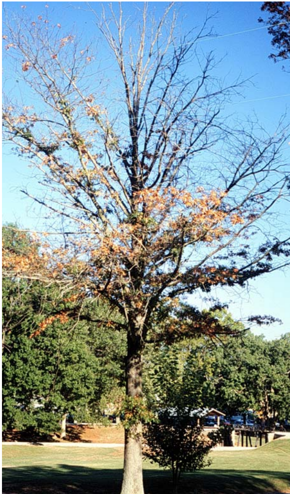
Advanced symptoms of bacterial leaf scorch on a pin oak.

The drought of 2007 is also affecting symptom development of bacterial leaf scorch (BLS) of shade trees. I have noticed many oaks in Tennessee that have leaf scorch and/or a shrinking canopy associated with bacterial leaf scorch. BLS is caused by an organism called Xylella fastidiosa . It is spread by leafhopper and treehopper insects. The only good news is that spread to adjacent trees is sometimes slow. In many cases, trees will scorch for several years, canopies will thin and the affected tree will die. In most cases, this is a terminal disease. Trees should be removed before they become a hazard or when their aesthetic value has diminished.